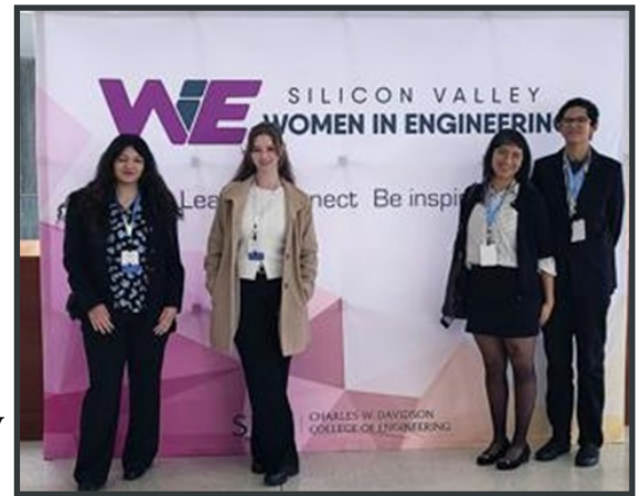
Photo of Shasta College MESA students at the Silicon Valley Women in Engineering Conference at San Jose State University. 2025.