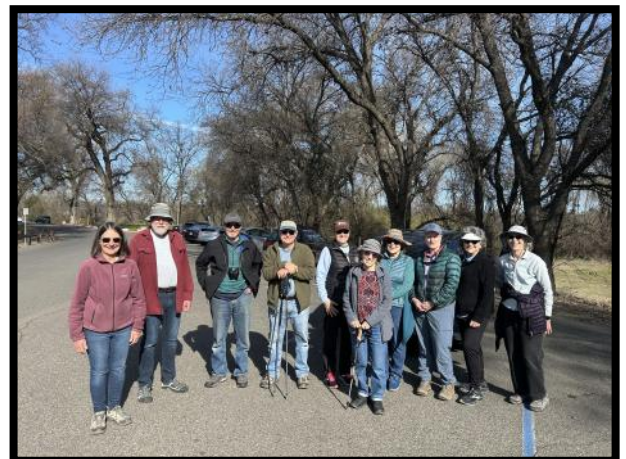
Our Walking Group

4/26 Clover Creek Preserve (parking Shasta View & Venus Way)