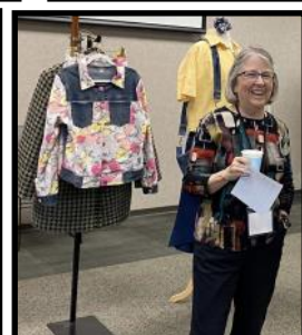
March Branch Meeting