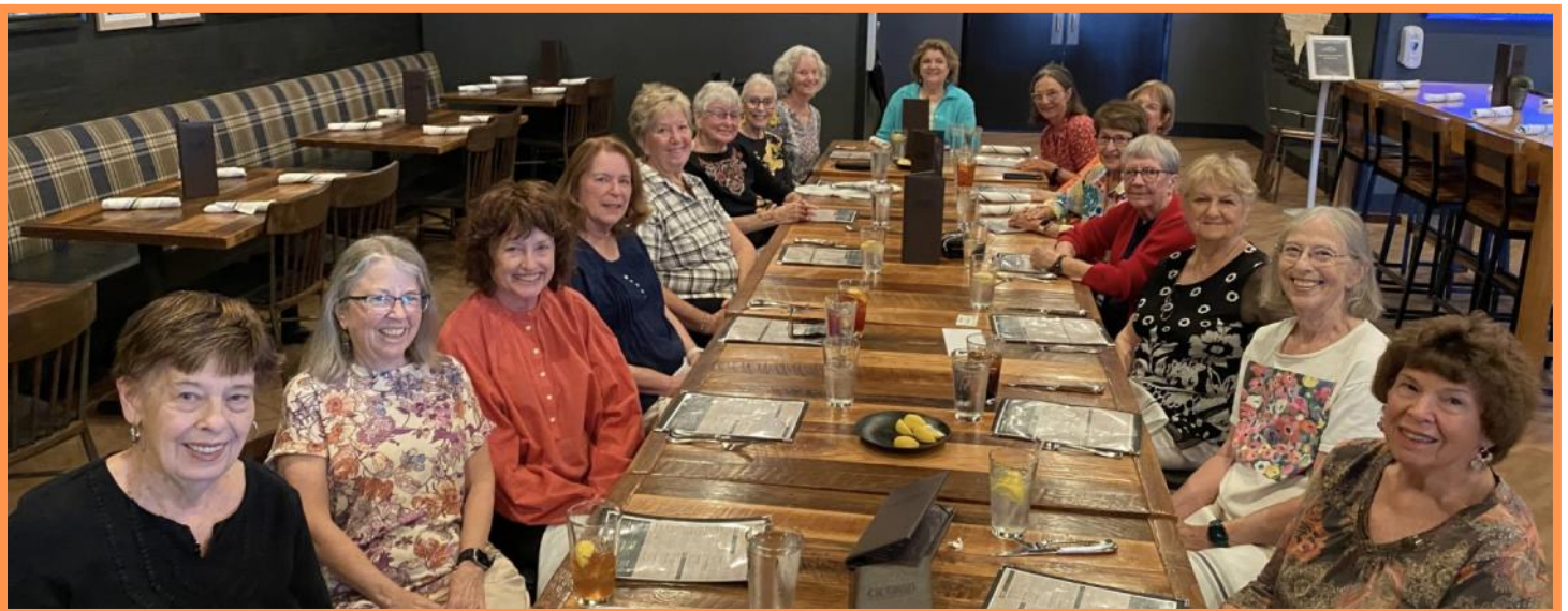
Past President's Luncheon, October 5th at C.R. Gibbs.