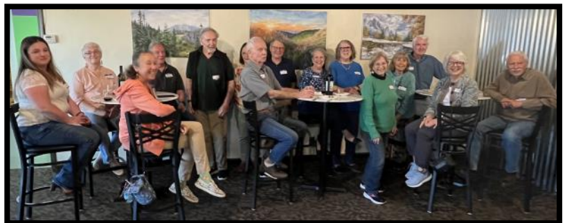
April 2023 Wine and Brews at Ridgetop Cellars in Shasta Lake City